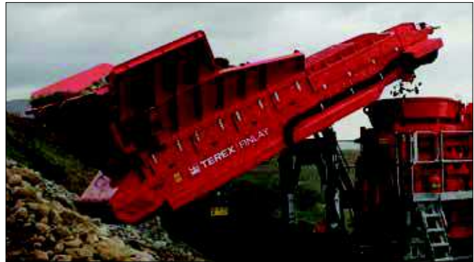
Hopper and Feeder

Unrestricted feed opening reduces blockages, bridging and maximizes output