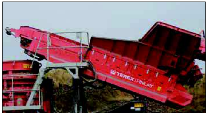
Hopper and Feeder