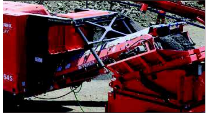
Main Conveyor - shown with optional dust covers