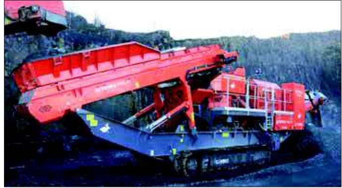
Hopper and Feeder

Unrestricted feed opening reduces blockages, bridging and maximizes output