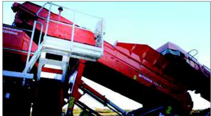
Hopper and Feeder